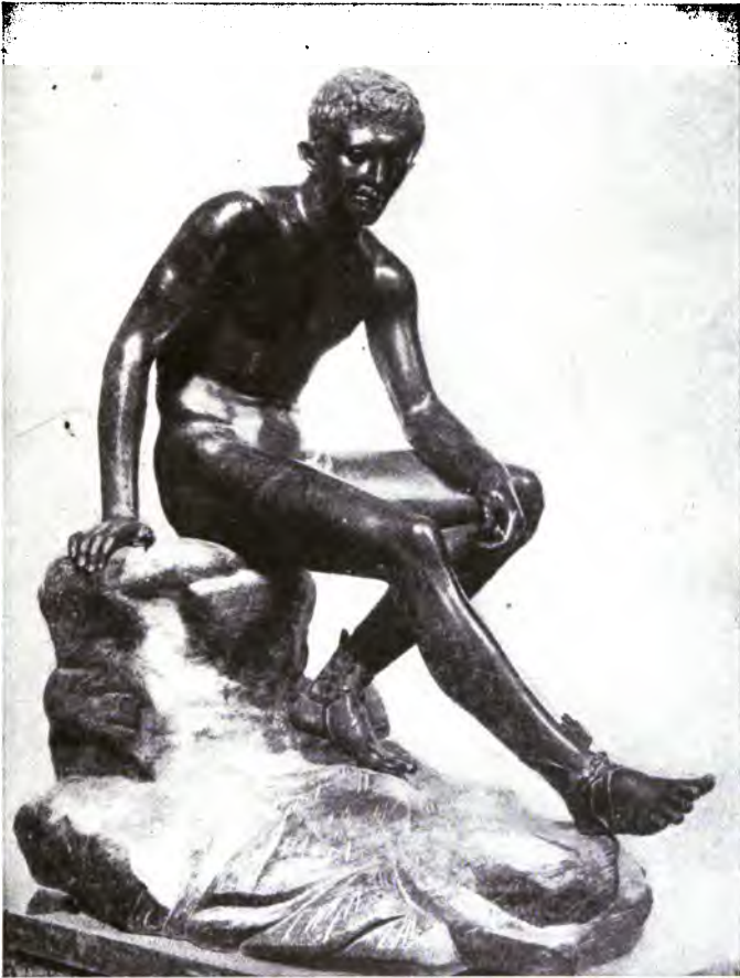
Fig. 24. Hermes in Repose.